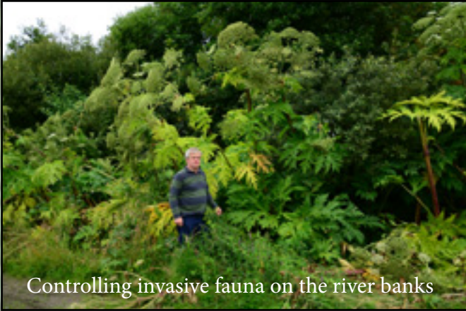
Controlling invasive fauna on the river banks