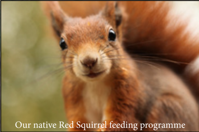
Our native Red Squirrel feeding programme